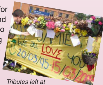
Tributes left at John Hanson School